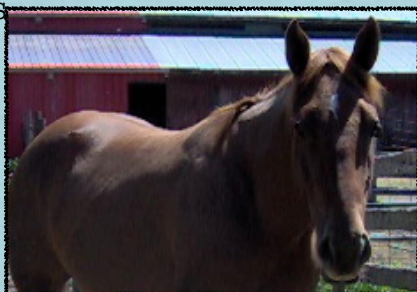
SAPHIRE READY TO BE ADOPTED.

Coco was one of the many that was caught in an unfortunate situation. A beautiful health Appy mare, smart, well trained, and deserving of another chance. We have also acquired two gray well cared for Arabs. In working with the Humane Society of the United States we are trying to help place 7 horses that need homes because of owners illness.