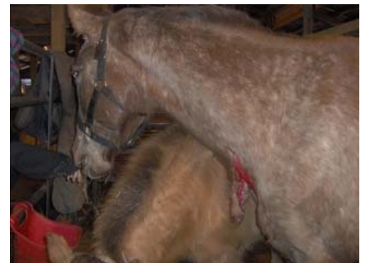
Candy getting some treats!