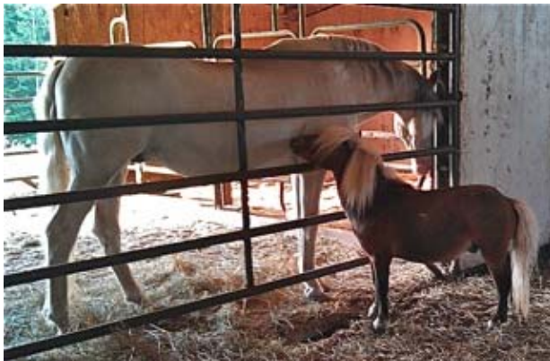
Everyone needs a buddy!

There are new upgrades going on at the rescue. We are remodeling and updating 8 stalls with all new doors, stall fronts, and dividers. When these are completed there will be a need for donated stall mats and feeders. This will be the new retirement home the senior residents.