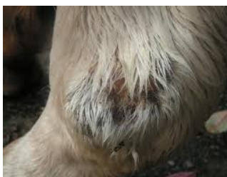
Mud fever or "scratches"

Equine skin conditions such as rain-rot, bed itch, ringworm, lice, and mud fever can be common during wet winter and spring months. To help combat this, try to keep your horse dry, clean and groomed. Also, be careful not to blanket your horse when he is wet and do not use blankets that do not breathe well. This can create moisture build-up and cause skin infections. Talk to your veterinarian promptly for treatment of skin ailment. Once they get started, they can spread quickly and are that much harder to stop.