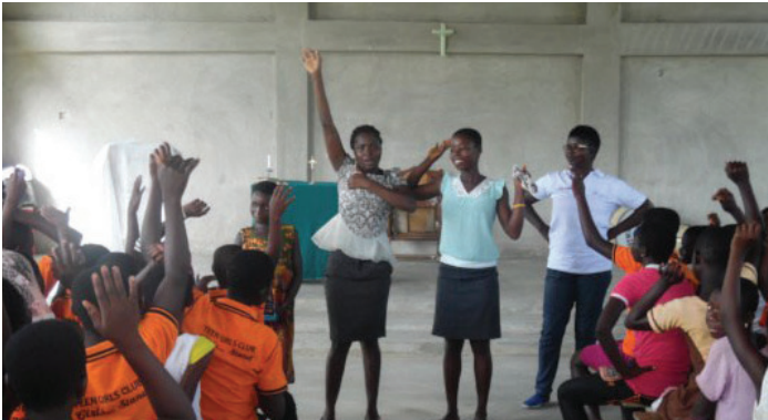
Asking questions during women's health training

Self-Help International Teen Girls Club has been helping teen girls stay in school and complete their formal education since September 2016. Since unplanned pregnancies are a leading cause of girls dropping out of school, and often dooms them to a lifetime of rural poverty, Self-Help has been leading workshops for the Teen Girls Clubs on topics requested by the participants, their mothers, and community leaders such as reading, community clean up, citizenship, and reproductive health education. The basic education initially offered was insufficient for some young women, and women of all ages in the villages we serve began asking for more comprehensive family planning services. We knew that women's health was critical to the health of the whole family – particularly if they're the only breadwinner and only earn income on days they're healthy enough to work – yet the medical knowledge required was beyond our areas of expertise. We needed a partner who could offer high quality education and affordable healthcare services by trained health professionals.