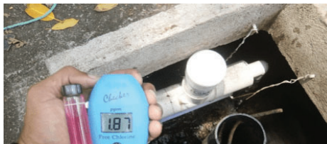
Clean water program officer, Orlando, makes a random visit to sample the water in the chlorination system