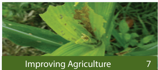
Improving Agriculture 7