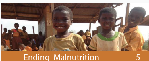
Ending Malnutrition 5