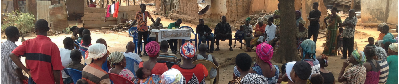
Families gather under a mango tree in Beposo to learn how to enroll in the nutrition intervention on February 23rd, 2018

Over the past two years, Self-Help staff members have measured the heights and weights of the students who are receiving breakfast porridge made from Quality Protein Maize (QPM) through the Self-Help school-feeding program when school is in session. In some communities, as many as 1 in 4 students' growth is already stunted when they start school. The children are not only short in stature, but stunting affects their ability to learn and long-term productivity for the rest of their lives that cannot be overcome by better feeding later in childhood or adulthood.