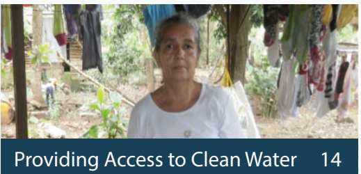
Providing Access to Clean Water 14