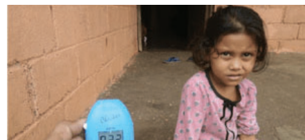
Children in La Reforma are now drinking clean water everyday