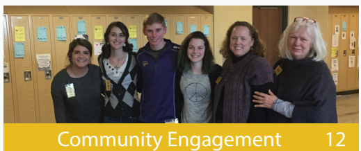
Community Engagement 12