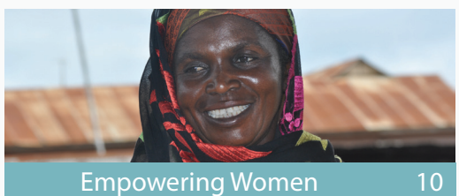
Empowering Women 10