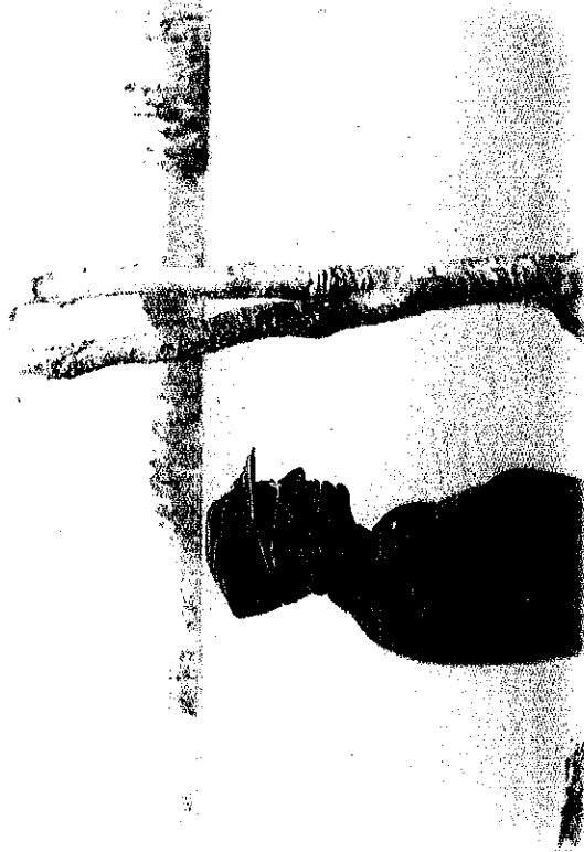
Aldo Leopold Foundation archives

Our vision for these awards is to highlight the work of our award winners, the UW-Madison Arboretum, and the Aldo Leopold Foundation to foster an ethical relationship between people and land, as envisioned by Aldo Leopold.