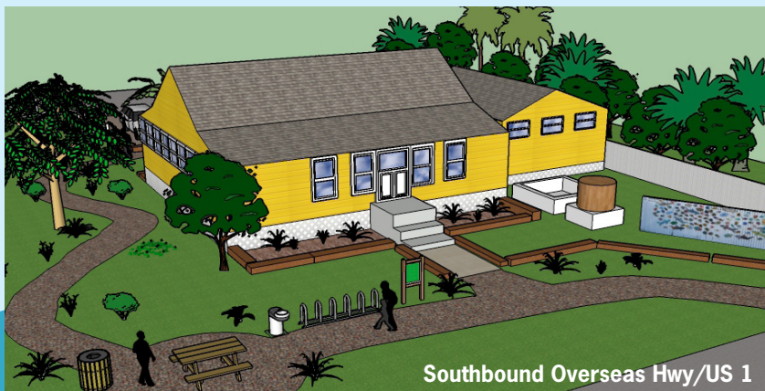
Southbound Overseas Hwy/US 1

REEF's Headquarters Campus is situated along the Florida Keys Overseas Heritage Trail , a walking and biking path that hosts 1.5 million visitors each year. To support users of the trail, REEF will install amenities such as picnic tables, benches, a drinking fountain, and bike racks, and create an outdoor Native Plants Trail with educational signage.