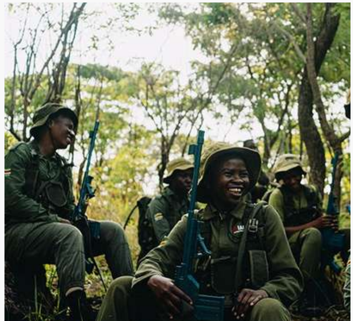
A select group of Akashinga Rangers take a rest as they attend LEAD Ranger's Advanced Field Ranger Instructor Course at Phundundu.

Through LEAD, we have helped train over 300 rangers across more than 36 organisations.