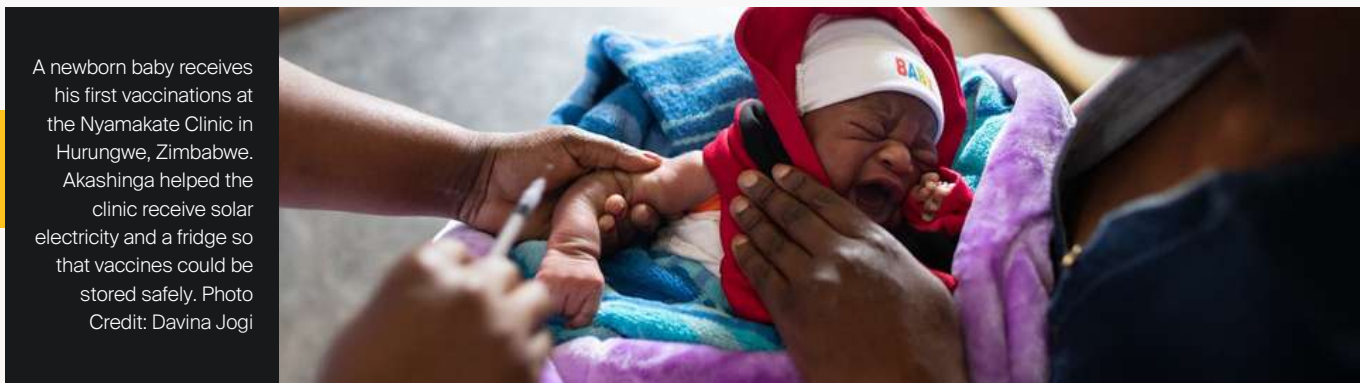
A newborn baby receives his first vaccinations at the Nyamakate Clinic in Hurungwe, Zimbabwe. Akashinga helped the clinic receive solar electricity and a fridge so that vaccines could be stored safely.

We aim to make substantial contributions towards safeguarding our planet’s self-regulating system of nature by creating sustainable conservation through working with local communities in the landscapes where we operate. Through education, clean water access, health clinics, employment opportunities, and infrastructure support, Akashinga works with individual communities to support their needs, highlighting the economic value involved in conservation work. As one of the largest conservation employers in Southern and East Africa, we are breaking the mold on traditional conservation models and creating green economies that have positive generational outcomes.