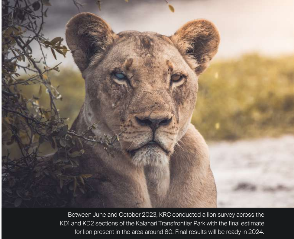
Between June and October 2023, KRC conducted a lion survey across the KD1 and KD2 sections of the Kalahari Transfrontier Park with the final estimate for lion present in the area around 80. Final results will be ready in 2024.

In 2021, our partnership with NGO Kalahari Research and Conservation (KRC) expanded our our initiatives into Botswana. Operating within the vast Greater Kgalagadi Transfrontier Park, covering five million acres (KD1 and KD2), we focus on protecting thriving lion, wild dog, and leopard populations. As the challenges of poaching and human encroachment escalate, safeguarding these species becomes crucial for maintaining the ecological balance of the region.