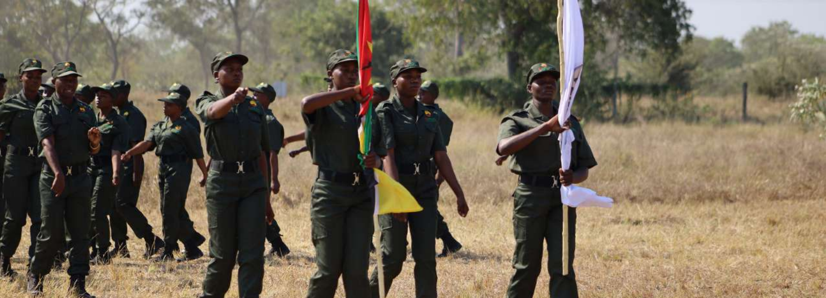
Our ranger training course's closing ceremony where the first Akashinga Rangers in Mozambique graduated in June 2023 stood as a milestone, endorsed by ANAC (Mozambique's National Parks department), local authorities, and media as a first of its kind in Mozambique.