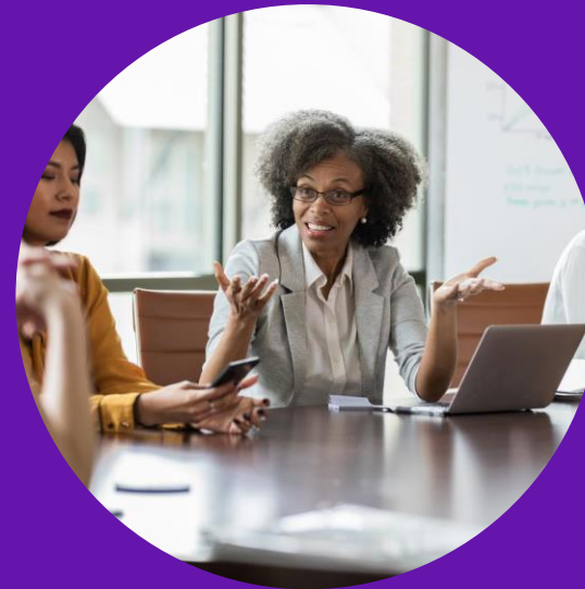
LWVCO Board of Directors