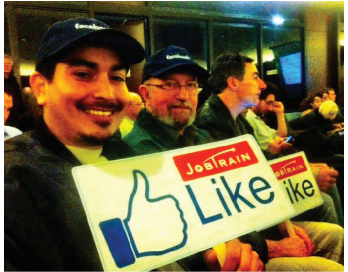
JobTrain staff and students carried signs bearing the Facebook “like” icon to show their support and appreciation for the social networking company at city council meetings. Facebook is lifting the spirits and hopes of their new neighbors according to speakers from schools, environmentalists and nonprofits.

agree that it’s better to have traffic because people actually have jobs – rather than traffic from hundreds of people desperately driving around trying to find employment?”